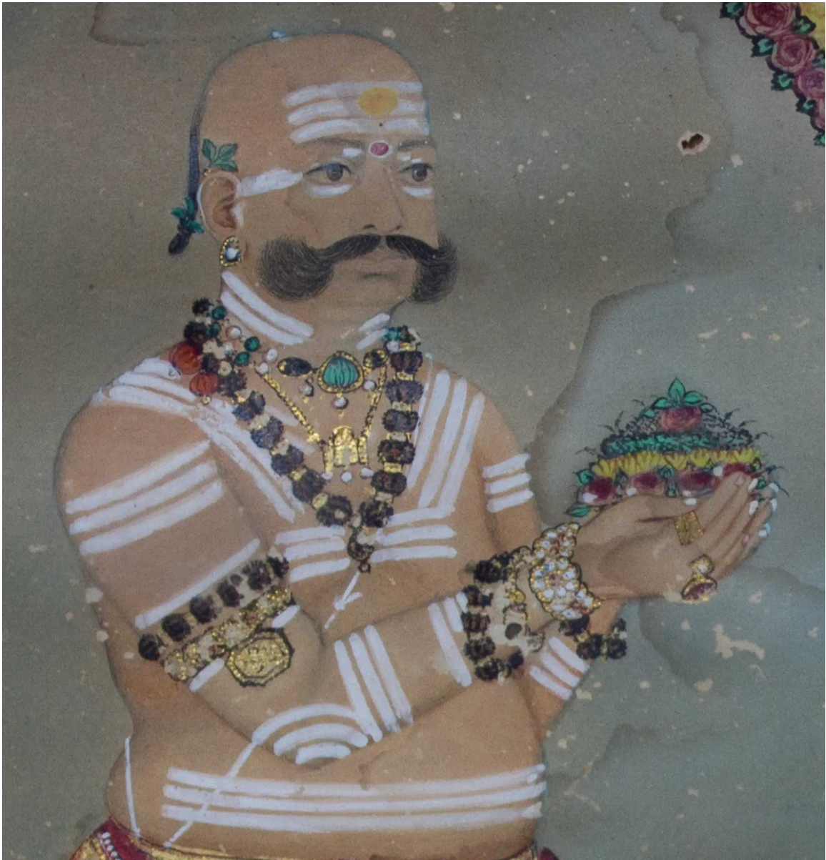
Figure 2: Detail of iṣṭaliṅga from figure 1.

not Vīraśaiva-Liṅgāyats considered themselves to be part of his Hindu fold (see Simmons 2020).