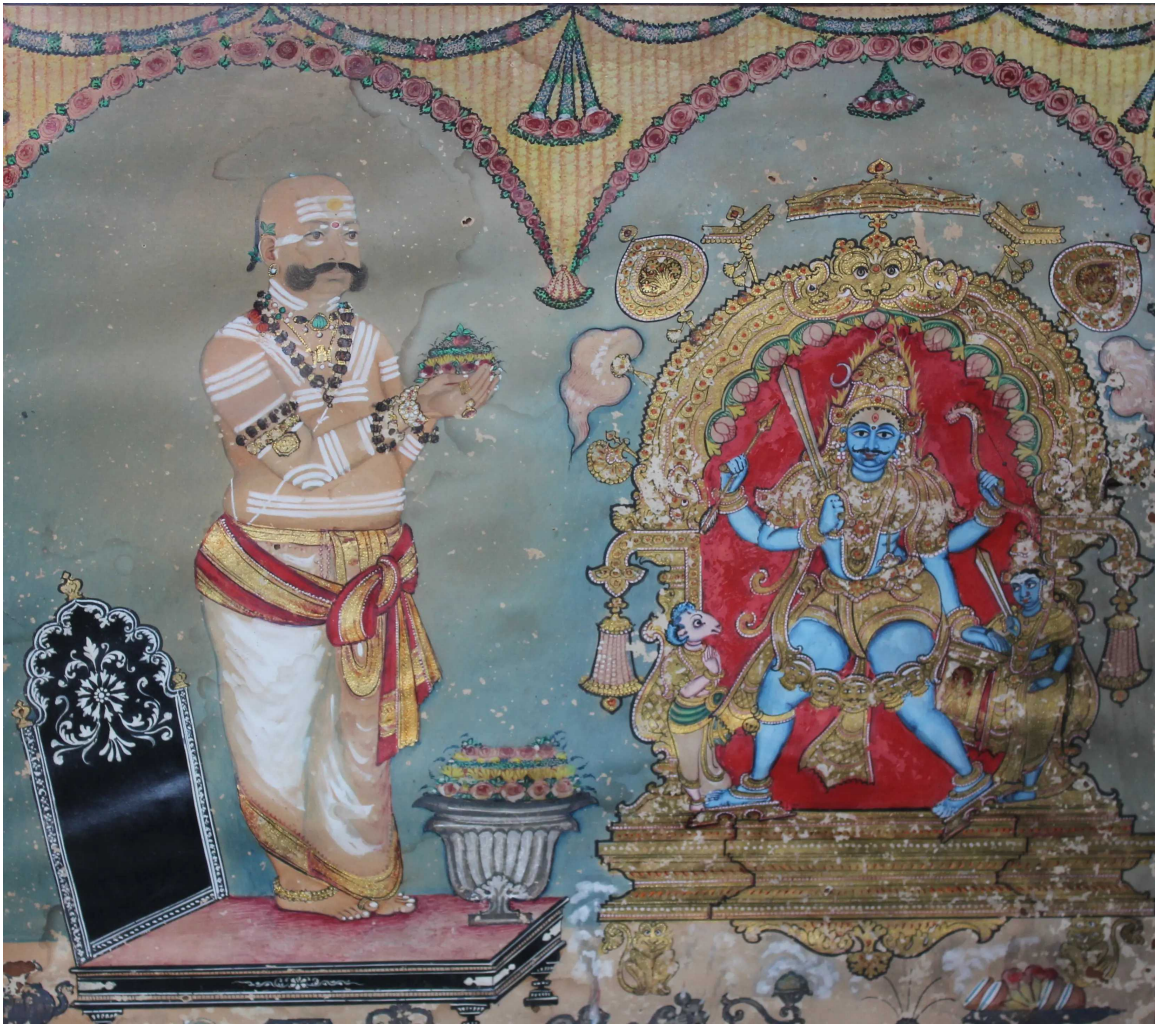
Figure 1: Kṛṣṇarāja III wearing an iṣṭaliṅga . Government Museum, Bangalore.

king wearing the outward signs of Vīraśaiva-Liṅgāyat devotion, a personal iṣṭaliṅga (figure 1), and conducting Vīraśaiva-Liṅgāyat ritual to his personal liṅga (figure 3). Through this display of his pious practice Kṛṣṇarāja III incorporated the Vīraśaiva-Liṅgāyat practice within the royal ritual repertoire, projecting his new persona as the Hindu king and the king for all Hindus for both his subjects and his British overlords, regardless of whether or