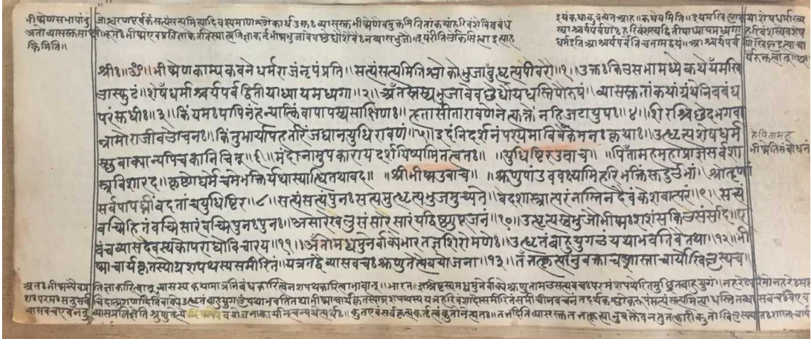
Figure 1: Leaf from the Pāṇḍakhaṇḍanavyāsastōtra with marginal commentary by an unknown author. Mysore Oriental Research Institute, ms. 4347C.

By the turn of the seventeenth century, a new form of incendiary ritual involving Vyāsa's amputated arm appears to have emerged among some Vīraśaivas in northwestern Karnataka. Vādirāja's Praising Vyāsa, Condemning the Apostates is the first writing that I know of to critique the practice of cutting Vyāsa's arm. Most of the essay is concerned with clearing up confusions about who, precisely, Vyāsa speaks for as a raconteur of epic events. But the last verses suggest that Vādirāja directed the essay toward a generic Śaiva devotee — an "idiot" — who wants to cut Vyāsa's arm not just notionally, it would seem, but in practice.