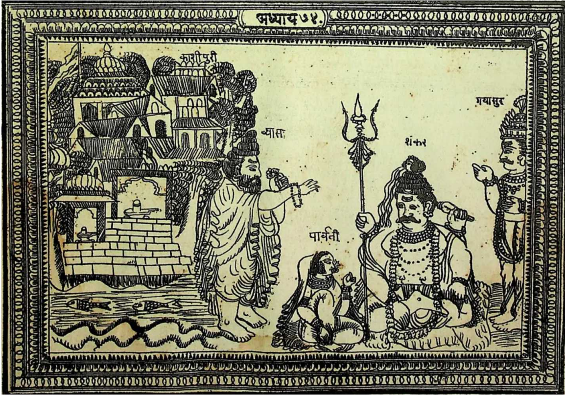
Figure 2: Lithograph of Vyāsa lifting his right arm while proclaiming to Śiva that Viṣṇu is the supreme lord. Frontispiece of the 74th chapter of a Marathi translation of the Kāśīkhaṇḍa (1881).

for his devotion, however, Viṣṇu admonished him. “O Vyāsa! You’ve committed a serious sin. Even I’m terrified by your offense.” 39 Viṣṇu explains: